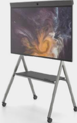
Neat Board (with floor stand)