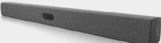
Neat Bar Pro