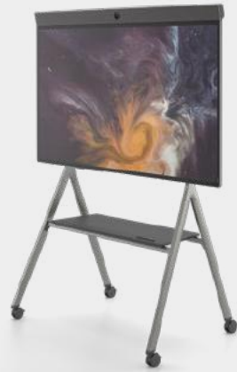
Neat Board (with floor stand)