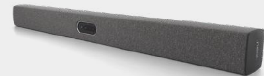
Neat Bar Pro